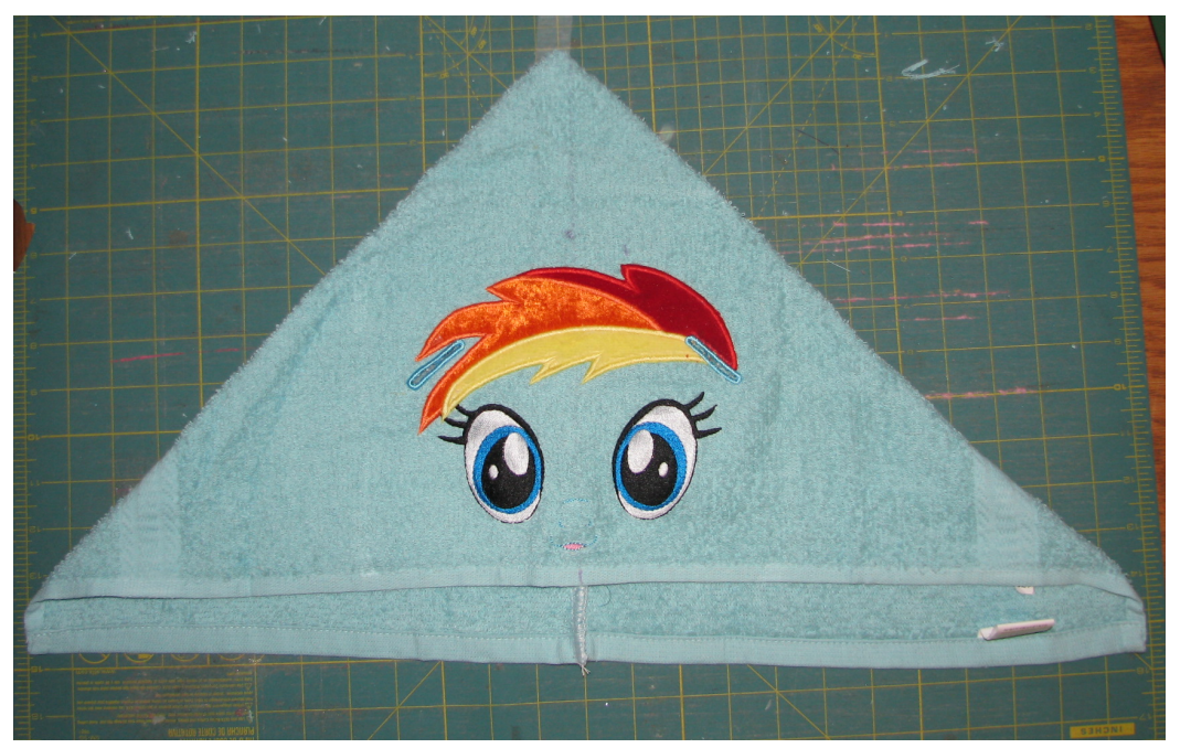
Step 7 . Turn the towel hood right side out and it will look like this.

Step 8. I like to cut the bottm finished edge of the towel off. See how there is a thick fold along the bottom of the previous picture? That seems too thick to stitch it to the main towel, but ive heard some people like it thicker there, so it is totally up to you. Either way, Ifind the middle of the main towel and mark it or pin it, then lay the main towel flat and the hood on top with the seam of the hood lined up in the